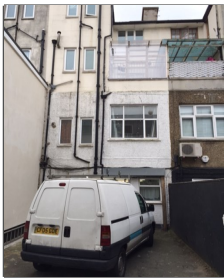
SLIA Building Rear aspect