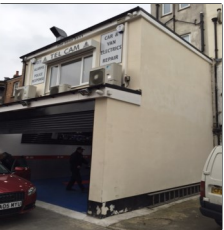
Adjacent building with rear extension