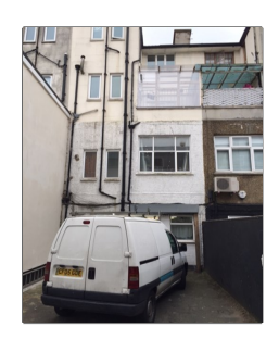
SLIA Building Rear aspect

Shamique Ismail Jazal Marzook Latiff Abdeen Althaf Zahir