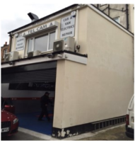
Adjacent building with rear extension