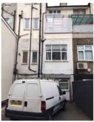
SLIA Building Rear aspect