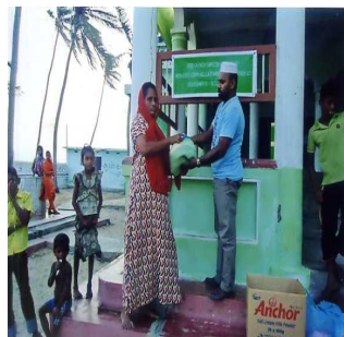
Jaffna; Mankumpan Mosque