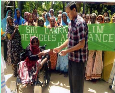
Polonnaruwa: Widows in Sungavila

Your generous donation is invaluable, to provide the essential relief to these refugee families. This is their time of need and more needs to be done; to return and resettle these refugees back in their homeland, after 25 years. We continue to increase the proportion of help rendered towards resettlement and re-starting the livelihood of these refugee families, and appeal for your generous donations to this worthy cause.