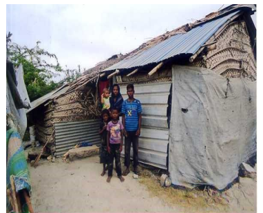
Jaffna; IDP Houses in Pommaveli

SLMRA receives a number of requests for help, but due to limitation of funds, we are often forced to turn down or scale-back our support. We appeal for your generous support so that more families can benefit and rebuild their lives.